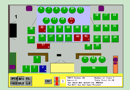
Table Plan Screen